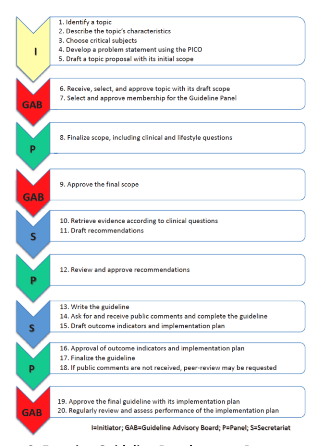
Figure 2: Estonian Guideline Development Process